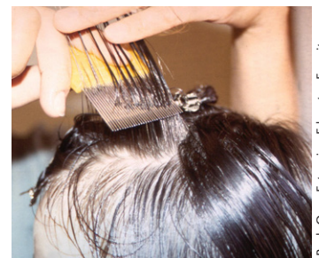
Some instructions include combing hair to remove lice and nits.

In addition, there is a variety of FDA-approved pediculicides (lice killers) sold over-the-counter or as a prescription treatment (see table on next page). These products are safe and effective when used as directed.