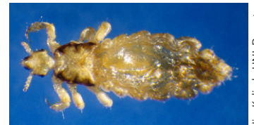
Magnified adult louse, which are the size of sesame seeds.

Adults — Adult lice are 1/16–1/8-inch long, wingless, brown-colored insects. They have pincher-like claws allowing them to firmly grasp hair shaft.