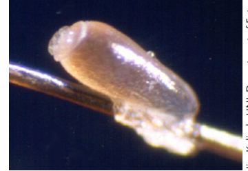
Egg or nit attached to hair shaft.

Viable eggs — Eggs (aka nits) are less than 1/32-inch long, light brown/yellow/white, oval-shaped, and are glued to one side of the hair shaft. Lice eggs are located no more than 1/4 inch from the scalp and are common at the nape of the neck and close to ears.